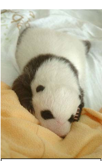
Panda # 4 sleeps on her blanket.