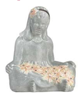
"Sometimes the best use of a summer day is to make no use of it at all."

Kathryn will forever be a part of Naper school.