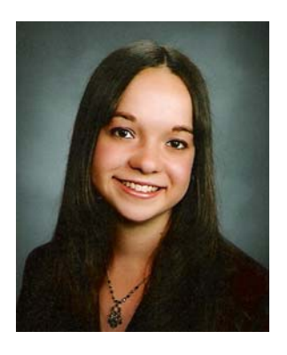
Please visit: www.kbmf.net